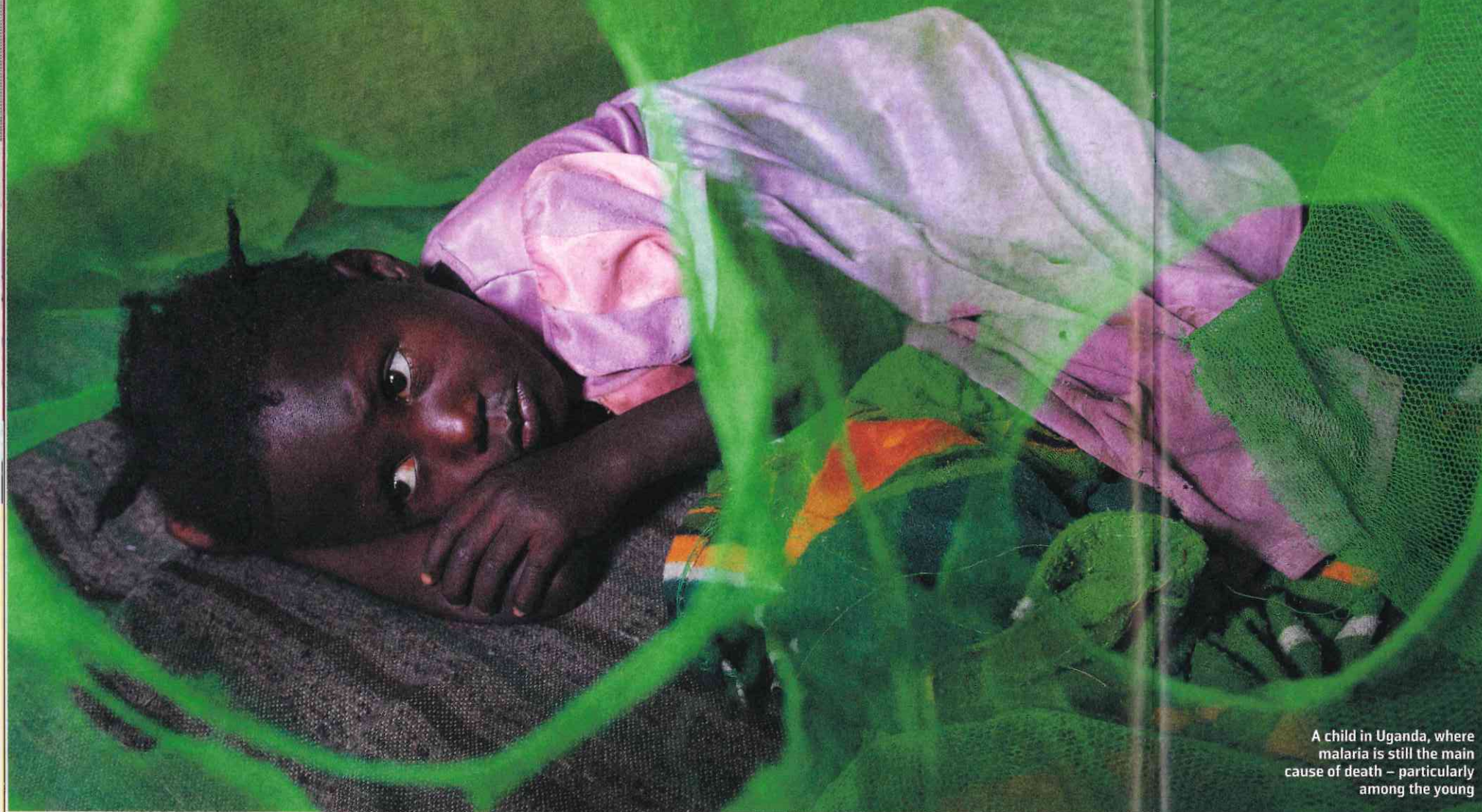
A child in Uganda, where malaria is still the main cause of death – particularly among the young