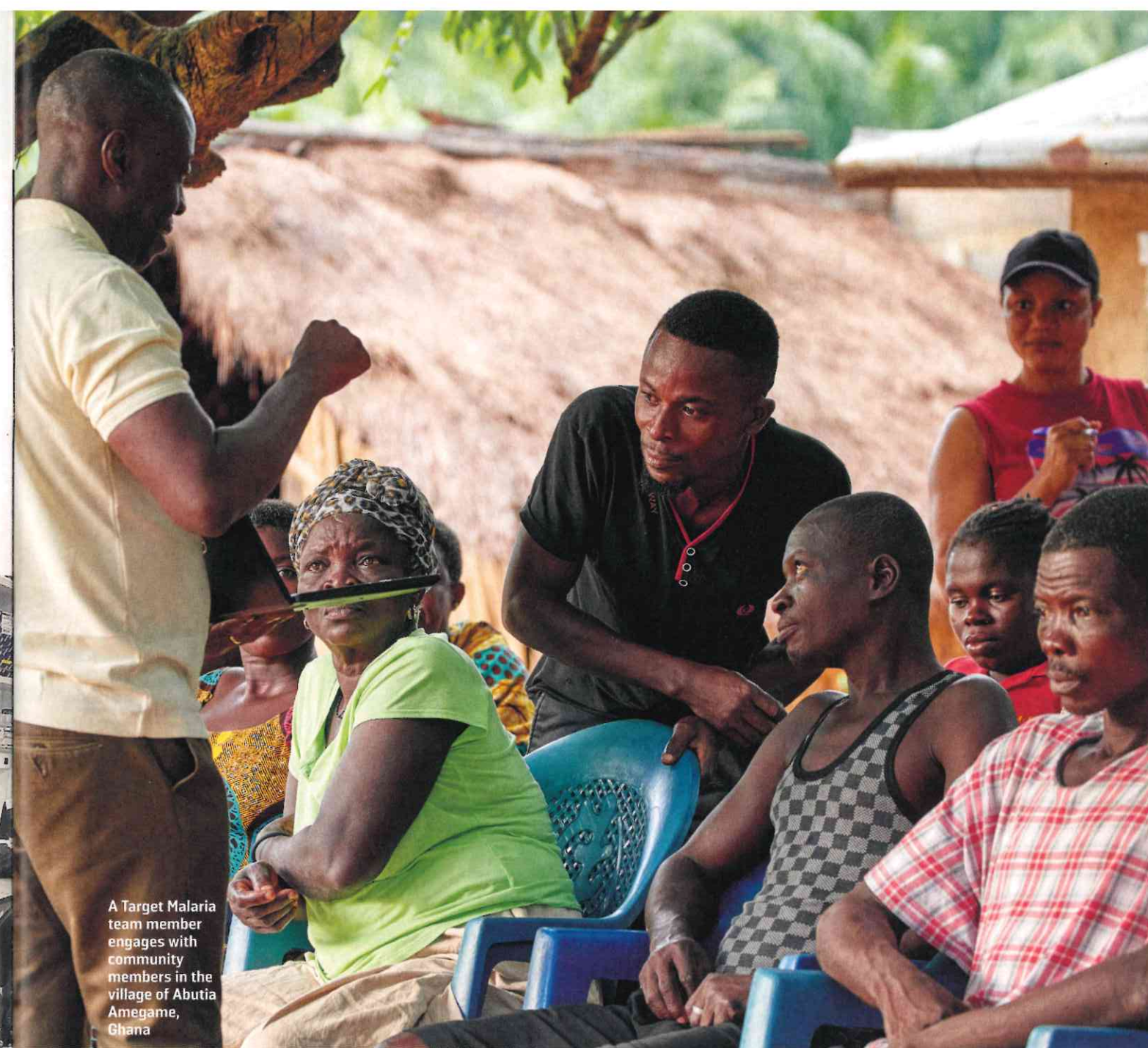
A Target Malaria team member engages with community members in the village of Abutia Amegame, Ghana

In the opening statement of the WHO World Malaria Report 2022, director-general Tedros Adhanom Ghebreyesus writes that despite mounting challenges – including the arrival of Covid-19 – most countries have managed to hold the line against malaria. However, the effectiveness of our main tools against